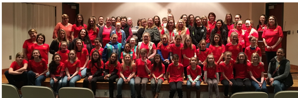
On Saturday, March 24, 2018, Girls in Mfg Club members along with friends, sisters, mothers, grandmothers, manufacturers, teachers, principals and volunteers gathered to celebrate our first Girls in Mfg Summit at Jamestown Community College in Olean, NY.

Before and after the Girls in Mfg Summit, participants were asked the following questions: